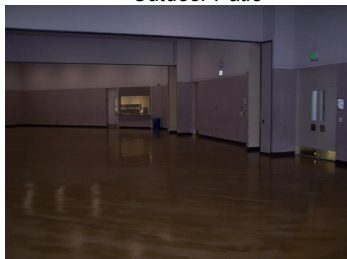
Large Main Hall